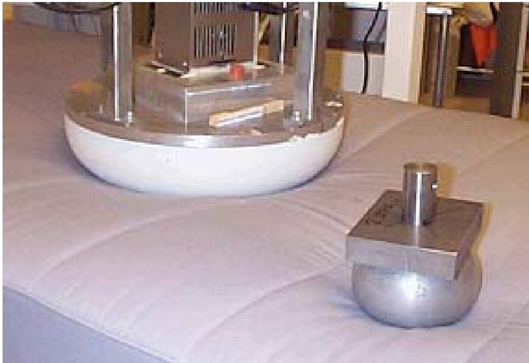
Figure 1 – Examples of large and small indenters

Note: Figure 1 shows examples of appropriate indenters.